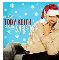
Toby Keith A Classic Christmas (Show Dog)